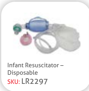
Infant Resuscitator – Disposable SKU: LR2297