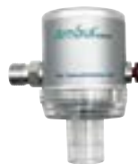
Oxygen Demand Valve Resuscitator SKU: AMB-DVR