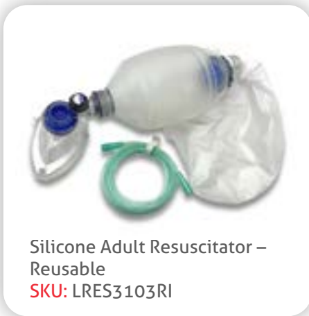
Silicone Adult Resuscitator – Reusable SKU: LRES3103RI