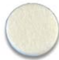
Nebuliser Spare Filter – Pack of 5 SKU: LRPNBF