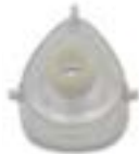
Resuscitation Mask Silicone - Large Adult SKU: LR5135