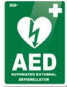
CardiAct Poly AED Wall Sign- SKU: CA-07