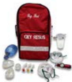
Large Resuscitation Kit – Big Red – With Suction SKU: mega005