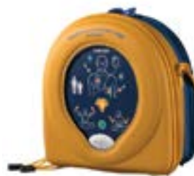
Heartsine Samaritan PAD 350P Semi-Automatic AED- SKU: PAD-350P