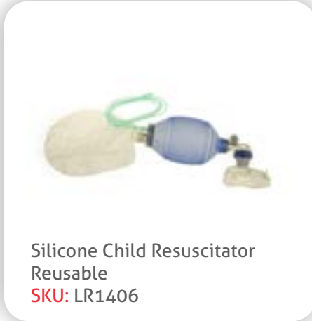
Silicone Child Resuscitator Reusable SKU: LR1406