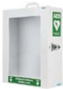
CardiAct Standard AED Cabinet SKU: CC-25