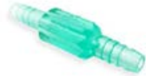
Oxygen Tubing Connector SKU: BOS1215