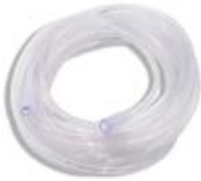
Oxygen Tubing 10m SKU: LR31610