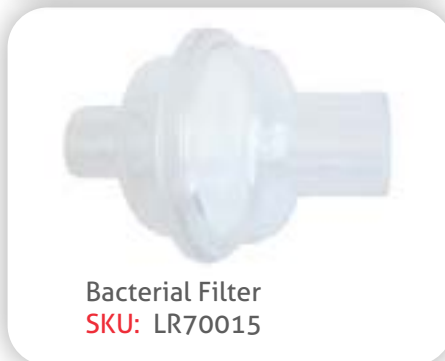
Bacterial Filter SKU: LR70015