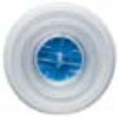
Demand Resuscitator – Diaphragm Valve SKU: CIG552082