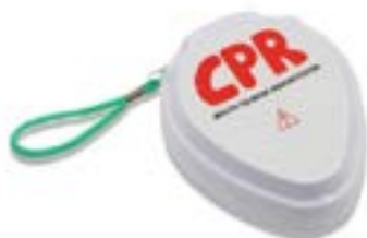
Pocket Resuscitation Mask with Filter SKU: LR1325