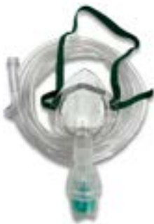
Child T-Piece Nebuliser Mask with 2.13m Tubing SKU: BOS8906