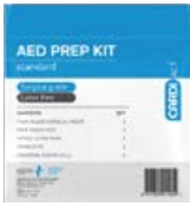
AED Basic Prep Kit SKU: CA-PK2