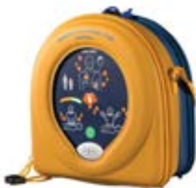
Heartsine Samaritan PAD 500P Semi-Automatic AED- SKU: PAD-500P