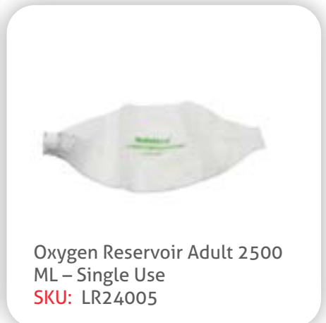
Oxygen Reservoir Adult 2500 ML – Single Use SKU: LR24005