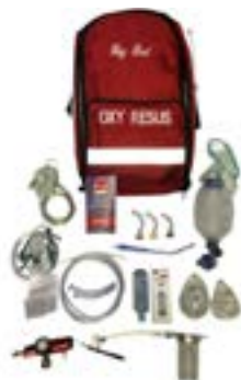
Combat Sports Resuscitation Kit SKU: Mega-Combat-Sports-Kit-Ex