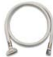
Oxygen Hose Assembly – Demand Fitting – 1m SKU: CIGMA169