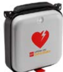
LifePak CR2 Semi-Automatic AED – WiFi SKU: CR-2