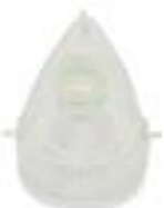
Resuscitation Mask Silicone – Child – (GaleMed) SKU: GA5133