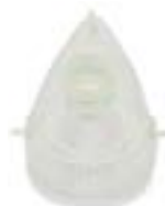
Resuscitation Mask Silicone – Large Adult – (GaleMed) SKU: GA5135