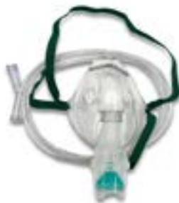
Adult T-Piece Nebuliser Mask with 2.13m Tubing SKU: BOS8924