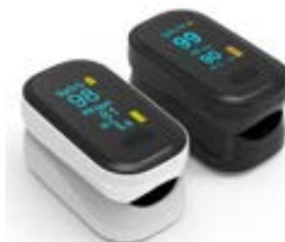
Fingertip Pulse Oximeter – Oxygen Saturation Monitor SKU: FPO100B