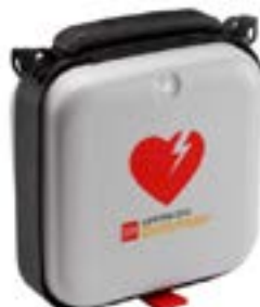
LifePak CR2 Essential Semi-Automatic AED SKU: CR-2E