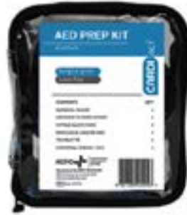
AED Premium Prep Kit SKU: CA-PK1