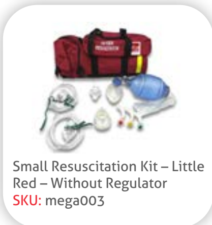
Small Resuscitation Kit – Little Red – Without Regulator SKU: mega003