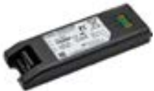
LifePak CR2 Battery SKU: CR-2-BAT