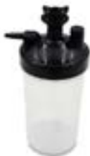
Oxygen Humidifier Bottle Disposable SKU: BOS7600