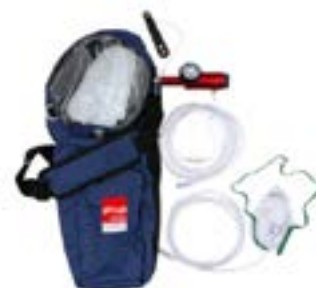
Emergency Oxygen Kit – Equipment Only SKU: mega-emerg-no-cylinder