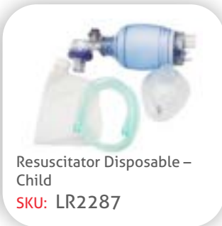
Resuscitator Disposable – Child SKU: LR2287