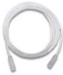
Oxygen Tubing – 2m SKU: LR2002