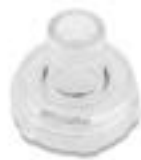
Patient Valve Assembly SKU: CIG552083