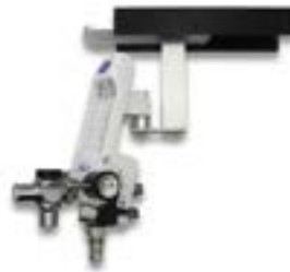
Porter 5 Inch Cabinet Mount SKU: 2035-1