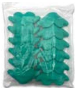
Porter Adult Disposable Liners – Pack 12 – Unscented SKU: 5053 AD12