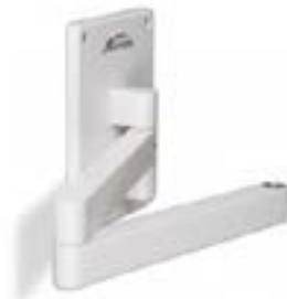
Bi-Fold Wall Arm SKU: GDAC32001