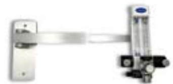
Porter MXR Telescoping Wall Mount SKU: 2020