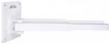
Telescoping Wall Mount SKU: GDAC32003