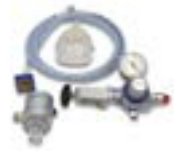
Analgesic Inhalation System SKU: MEGA-EQ550010