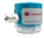
Entonox Demand Valve SKU: AMB-EQ