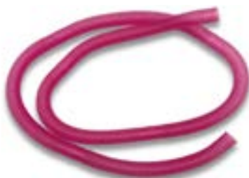
Scavenging Tubing – 1m SKU: 6789912