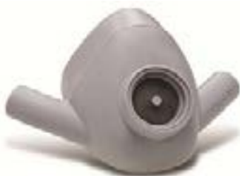
Autoclavable Nasal Hood – Large SKU: GDAC33018LG