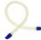
Corrugated Fresh Gas Tubing – Nitrous Oxide Flowmeter SKU: AMBCT1