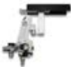
Porter 5 Inch Cabinet Mount SKU: 2035-1