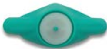
Porter Paediatric Disposable Liners - 12 Pack - Unscented SKU: 5053 PD12