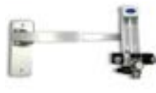
Porter MXR Tele- scoping Wall Mount SKU: 2020