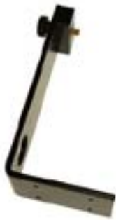
Wall Mounting Stand – Sedation Mixer SKU: AMBST02