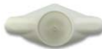
Paediatric Disposable Liners - Pack 12 - Citrus SKU: 5053 PD12C