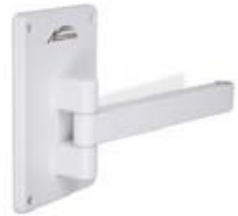
Single Articulating Folding Arm SKU: GDAC32002