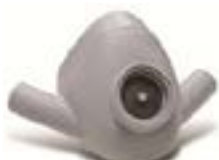
Autoclavable Nasal Hood – Medium SKU: GDAC33019Med