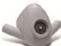
Autoclavable Nasal Hood – Small SKU: GDAC33020Sm